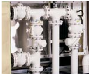
Optional discharge and suction line bypass pump connections available.